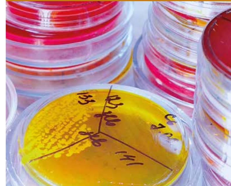
The Hohenstein Laboratory in Hong Kong – customized quality testing exactly where you need it.